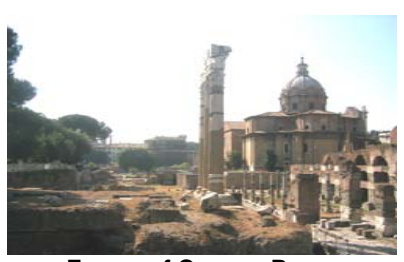
Forum of Caesar, Rome

"It was great - I got a better appreciation of classical architecture and history." \,