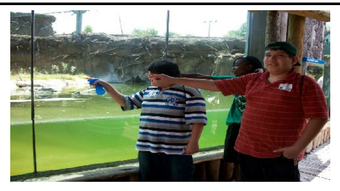
Students on field trip during Project S.T.O.M.P. Camp.