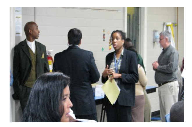
Graduate students interact with Parents during Parent Night at Wiley High School.