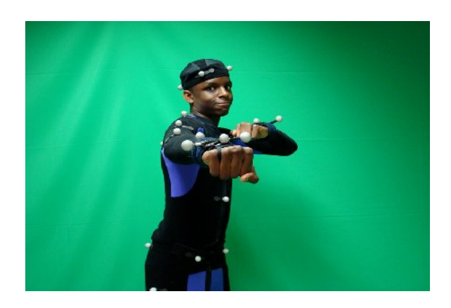
Student at the TSTC gaming camp wearing the motion capture suit used to digitize his likeness to be used in a mock video game.