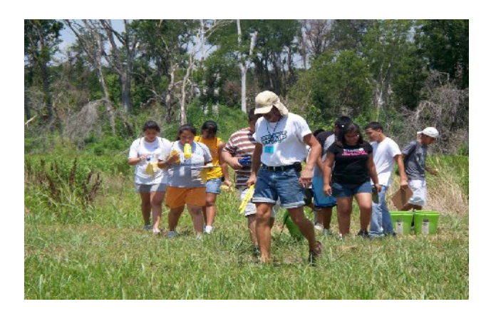
GEAR UP math initiative instructor led students on field trip during Project Stomp Camp.