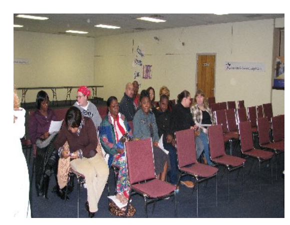
Parent Trip to TSTC.