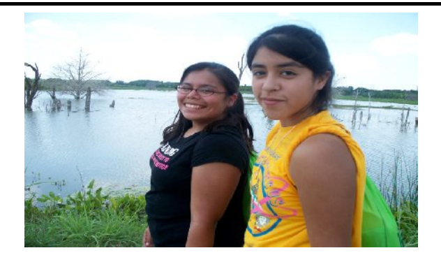
Students at the Wetlands during Project S.T.O.M.P. Camp.